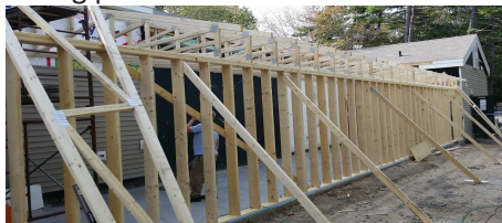
Walls and Trusses going up!

The renovations are well underway as you can see from the photos. Drop by sometime during the day and see the exciting changes that are taking place.