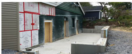
North Gallery ready for framing!