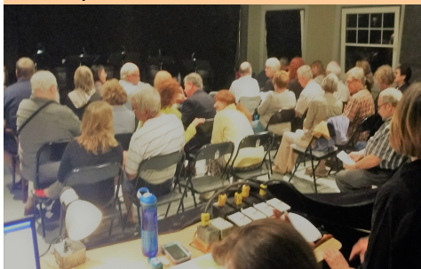
A Night at the Theatre!

All the debut performances were held in Gratwick Hall, the Pond Playhouse's rehearsal hall. This was a first for the space and was well received by all patrons who attended.