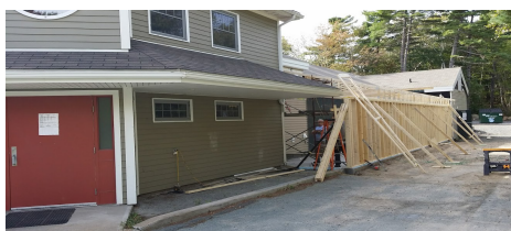
East Gallery from the front door!