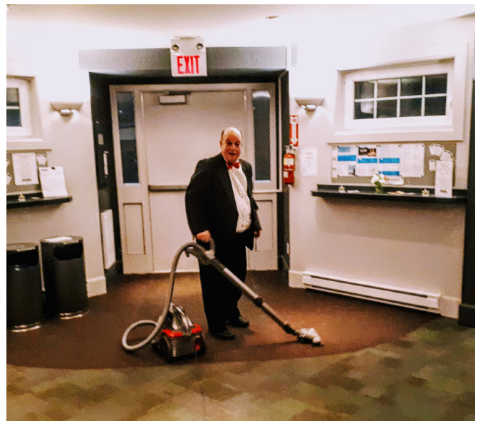
Volunteer at work after DUO