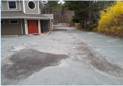
Parking lot before...