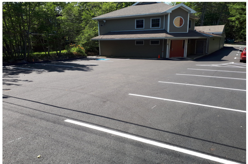
Theatre Arts Guild's Expanded and Repaved Parking Lot!

We look forward to seeing you there! Plus you can check out our brand new parking lot in person while you're at it.