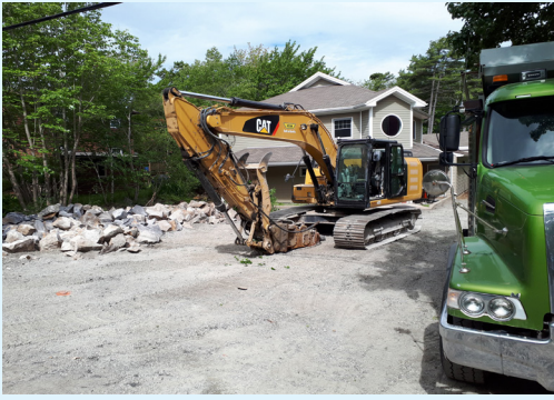
Parking lot in progress