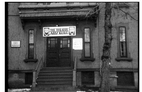
Theatre Arts Guild on College Street, 1958

All members in good standing are invited to attend the Annual General Meeting of the Theatre Arts Guild. The current Board will present annual reports including the financial statements. Elections will take place for the 2017-2018 Board. A nominating committee will present a slate of officers. Nominations will also be accepted from the floor.