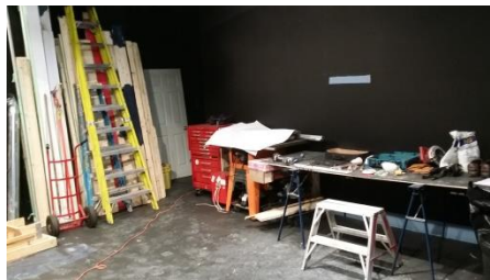
The stage is a storage area.