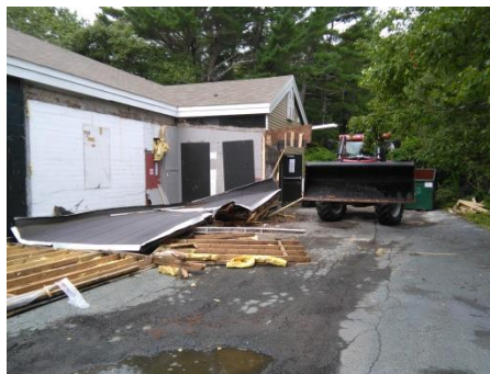
Our good neighbour Tree Works donated a dozer to tear down the old costume room.