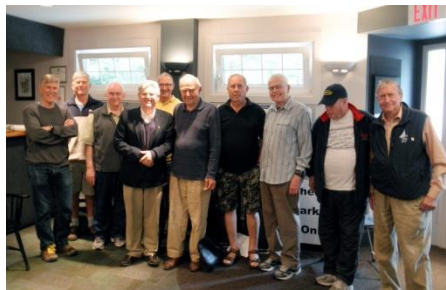
Some of the volunteer builders.