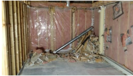
It used to be the Dressing Room