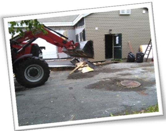
The former costume storage room is no more.

Congratulations to the entire cast and crew. It is safe to say that we had an incredibly successful season filled with wonderful shows and special events. I sincerely thank every person who contributed towards the transfer of these works from script to stage. I have no doubt that another successful year awaits as we kick off the 2017/2018 season with a staged reading of Order in the House .