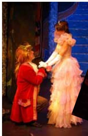
Scenes from TAG's holiday pantomime production of "Beauty and the Beast."

for more information about this exciting fundraiser.!