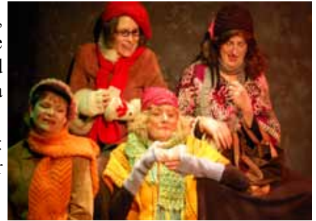
The cast of "Thirteen Hands"